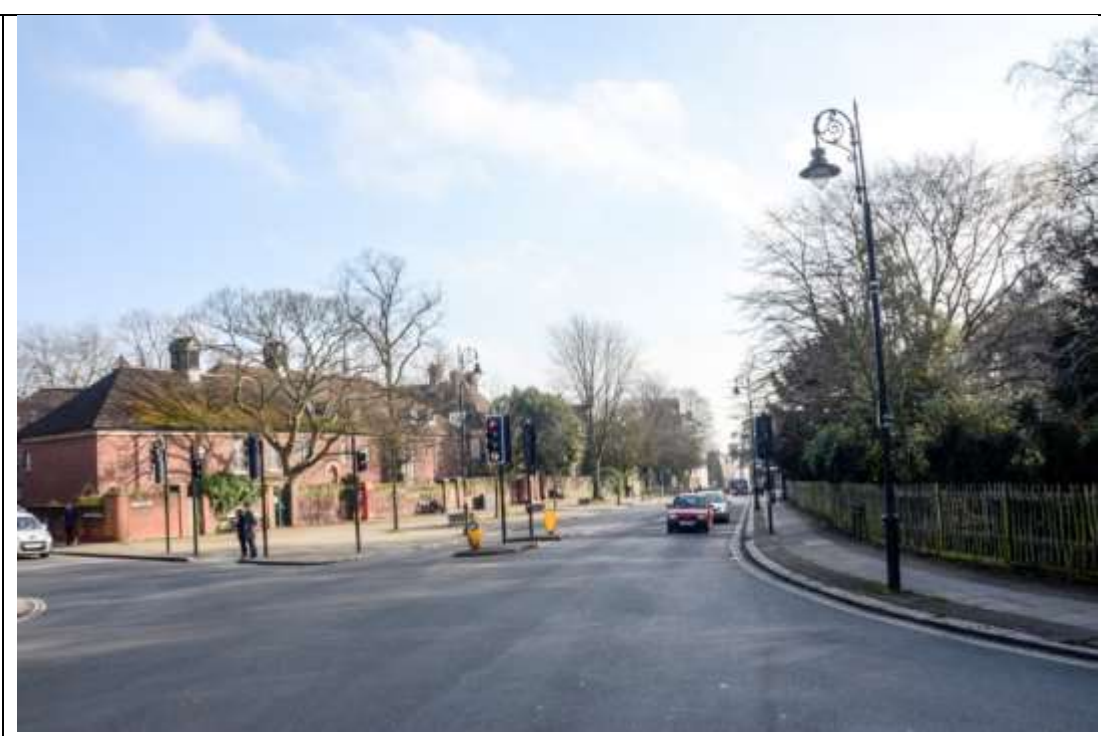
View looking south toward Heath Street, low-built Queen Mary's on left; green open space of Whitestone Gardens on right

The space is wide offering pedestrians, cyclists and vehicle users a wide vista. The boundary wall of Queen Mary Hospital offers some enclosure to the space with the low rise buildings of the hospital site siting well back from the wall and inconspicuous in the view. Another important open space to the right; Hampstead Whitestone Gardens, reinforces the sense of the Heath penetrating the built up area of the village, blurring the edges of the two.