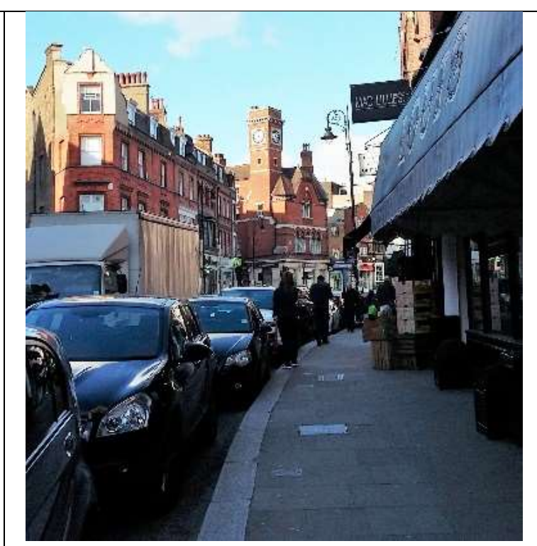
Looking north from Heath Street

and exhibit a regular parapet line with no visible roof level, typical of much of the High Street in this area.