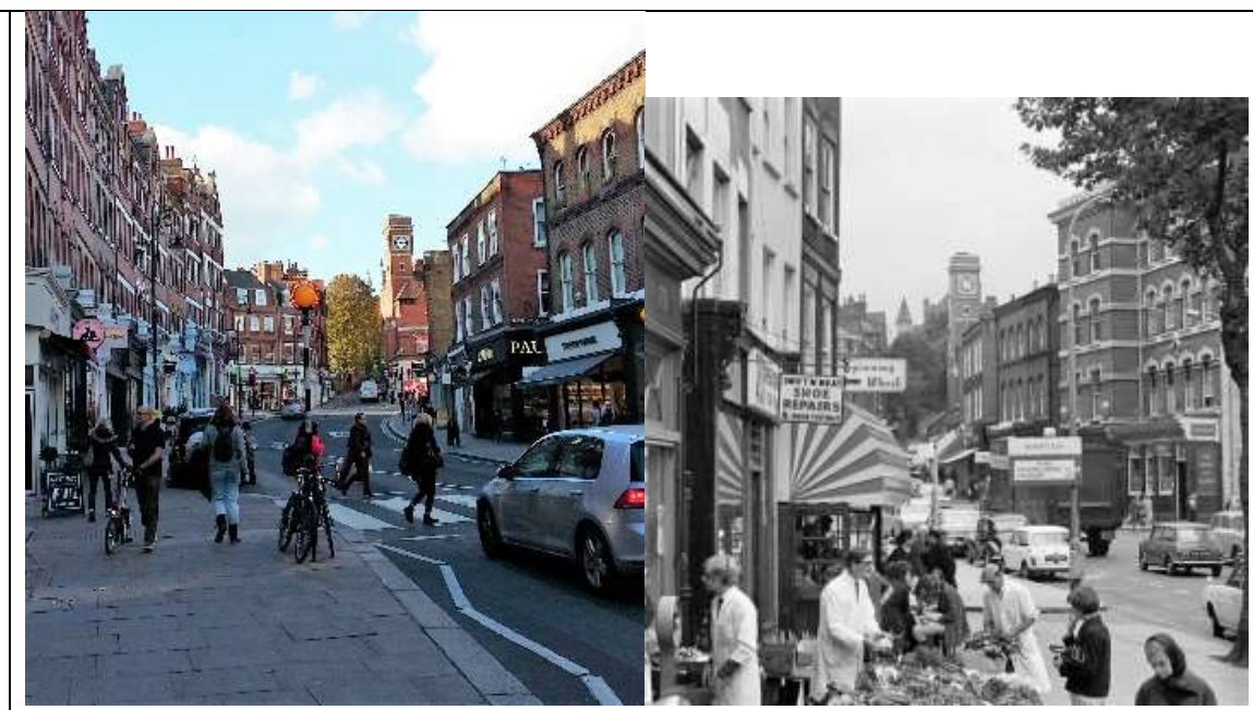
Looking west along High Street

Important elements include the subservience of the Victorian terraces and the clock tower itself. Mount Vernon Tower can be seen beyond the trees. The shopfronts generally consistent and of high quality, a general absence of amalgamation of shop units, vertical separation of shopfronts with mullions, consistent fascia size, cornices, pilasters and corbels. Red brick buildings dominate. Highly decorated on one side as a continuous terrace contrasting with individual