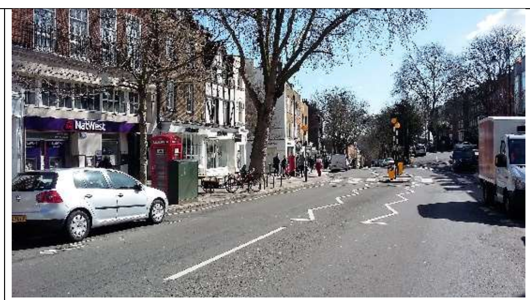
Looking east on High Street

Buildings are more varied in this part of the High Street, but the view highlights the attraction of the broadly consistent building heights.