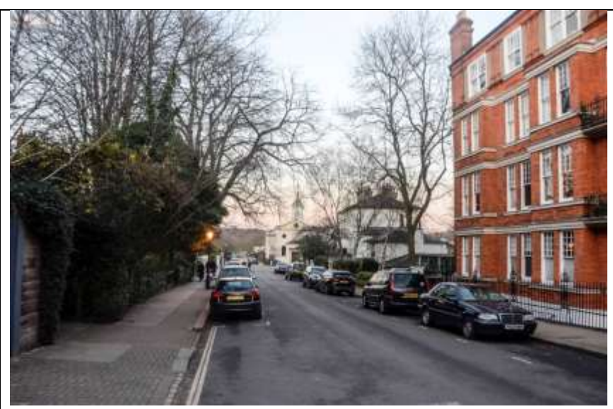
View of Downshire Hill, St John's and Heath in the distance

Important elements include the wide variety of well-designed and historic buildings, along with the street trees and those in the gardens of the houses.