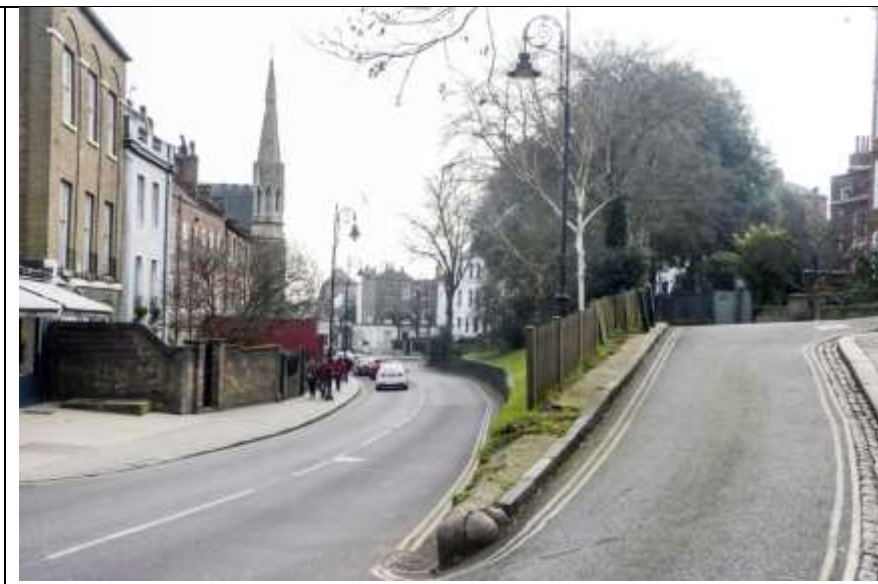
View of The Mount looking south

6. From Heath Street to St John-at-Hampstead, Church Row Significance: this is one of the few views in Hampstead that was deliberately composed to accentuate the prominence and status of the Church.