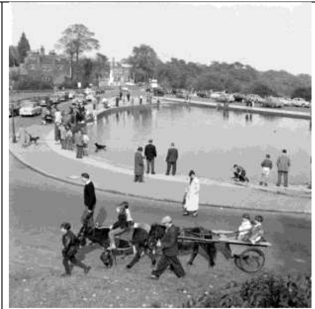
Similar view from the 1950s