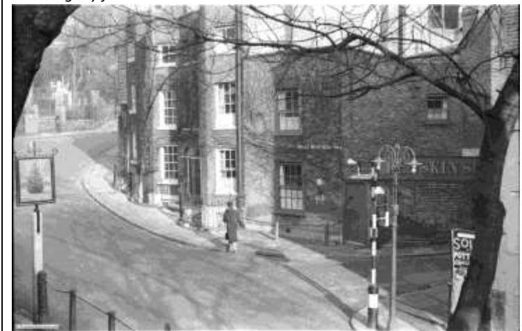
A similar view from 1949