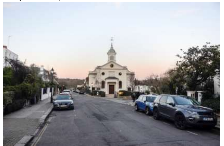
View approaching St John's, with Keat's Grove is to the right