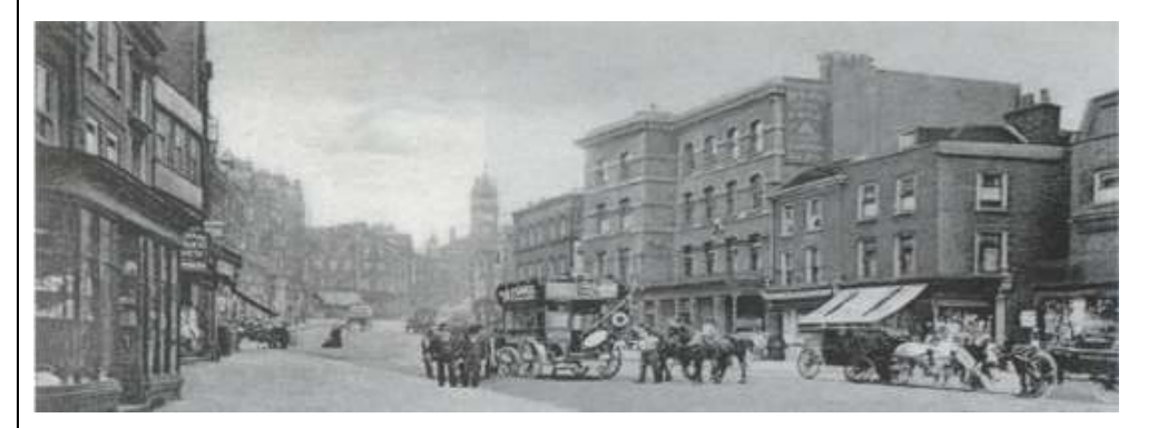
Similar view from 19th century