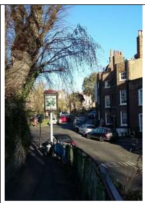
From slightly further back