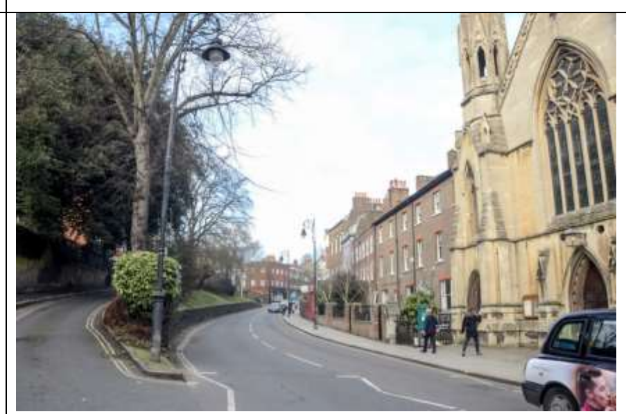
View of The Mount looking north

urban landscape and is well known as the location of the painting "Work" by Ford Maddox Brown. Important elements include the brick boundary treatments to houses around The Mount, the large and mature trees and change in levels. The View along Heath Street from the north towards the south is equally important. The green space dominates both these views (from north and south) with the buildings of Heath Street, many listed, set back from the pavement edge by small front gardens. The twin spires of the Baptist Church rise above the buildings and are seen in these views. As a major route through the area the views are experienced by pedestrians, cyclists and vehicle users.