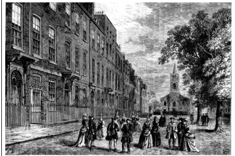
Similar view from 18th century

The majority of the buildings in the view are listed. It is a setpiece in Hampstead and in London.