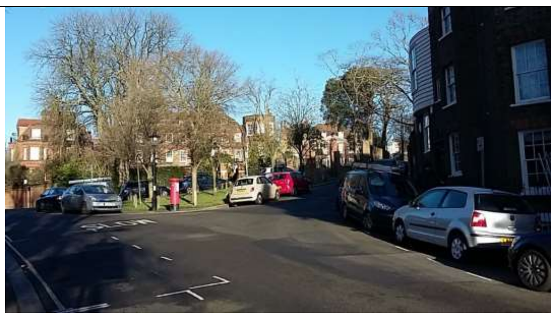
From Holly Bush Vale toward Fenton House

Important elements include the small green, the boundary walls of the buildings and the changes of level that reinforce the village character of the wider area.