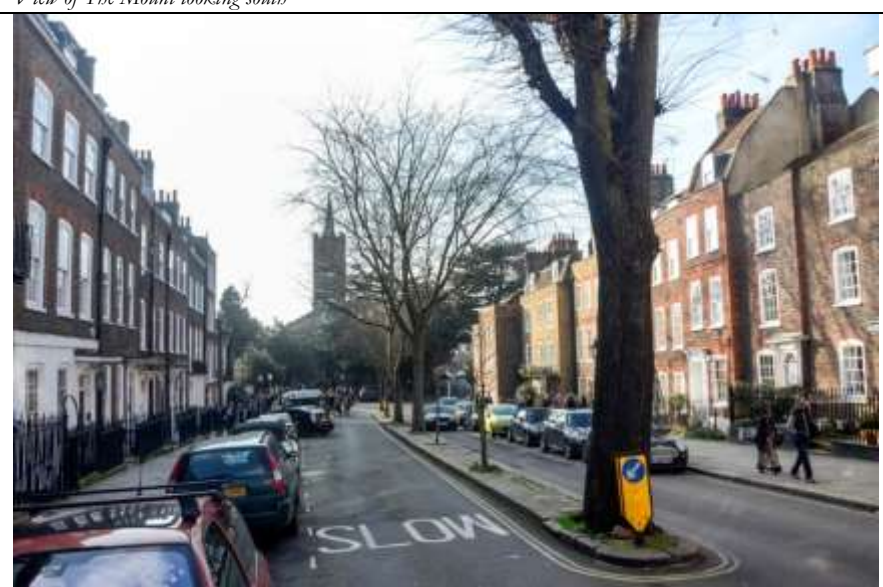
Church Row from Heath Street

On Church Row Ian Nairn wrote in Nairn's London, 'Here is the complete freedom which results from submission to a common style. A rough gentlemen's agreement about height and size – nothing so rigid as a fixed