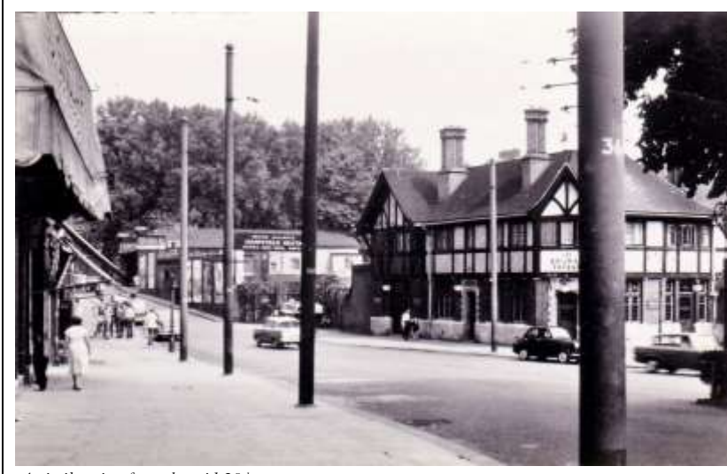
A similar view from the mid-20th century