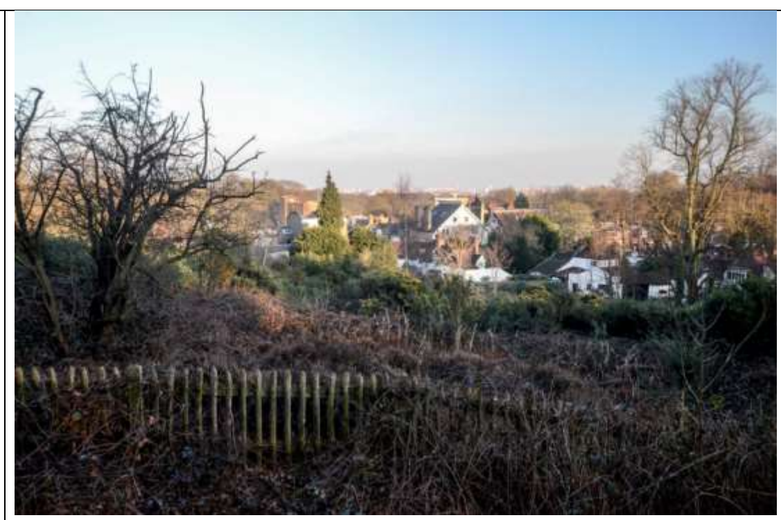
The view across the Vale of Health toward the City beyond

The foreground of Heath land gives way to the treed mid ground of the Vale of Health. The roof tops of the homes in the Vale are generally pitched and do not break the tree line so preserving the panorama uninterrupted. Tile and slate roofs are prevalent. Some of the upper levels include large mansards or flat roofs which are generally prominent and to be avoided. Large areas of glazing and / or full width dormers, plant and lift overruns as well as large areas of flat roof tend to detract from the view. Pitched roofs in slate or tile, roof lights and narrow dormers set below the roof apex are likely to cause less harm.