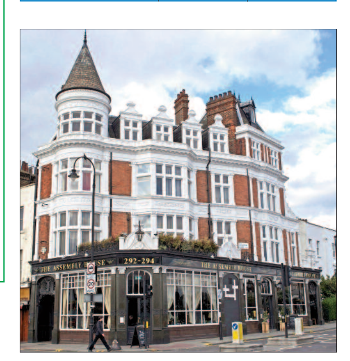
▲ The Assembly House, Kentish Town Road, Grade II listed