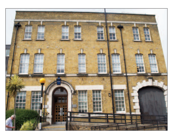
▲ The Police Station, Holmes Road. Grade II listed