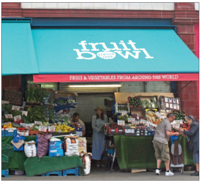
▲ Fruit Bowl outside Kentish Town Station

and no improvements are programmed by the water company, then the developer needs to contact the water company to agree what improvements are required and how they will be funded prior to any occupation of the development.