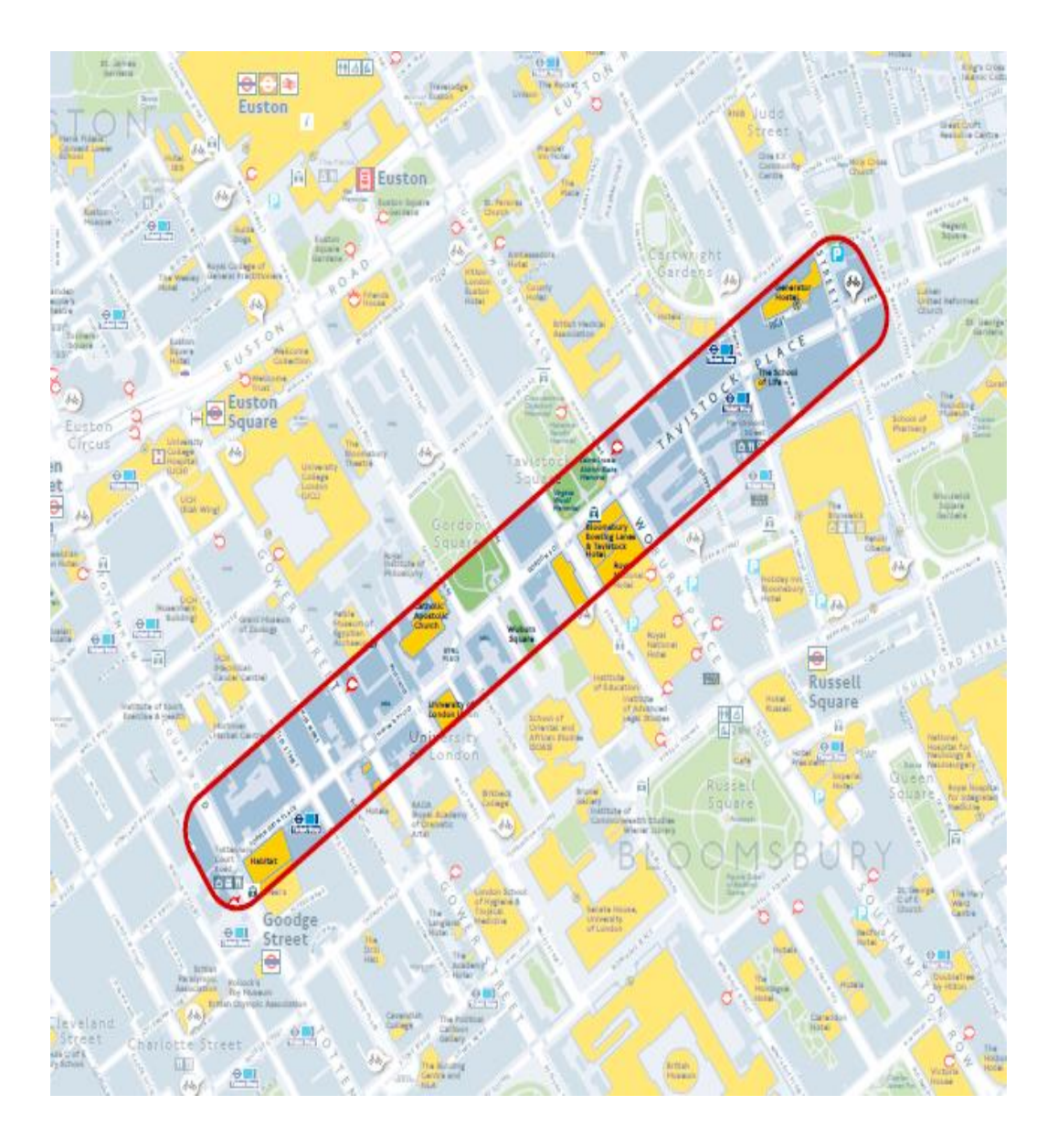
Figure 2. Arrangements for motor traffic along the Torrington Place/Tavistock Place route (before and during the trial)