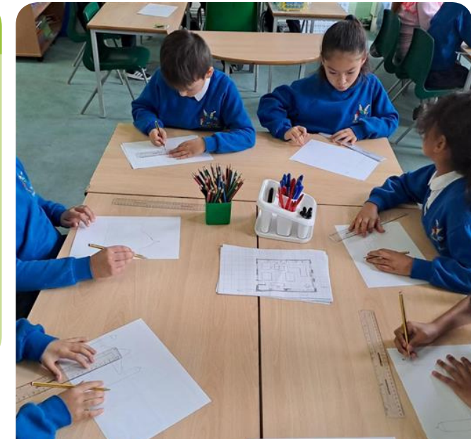
STUDENTS DESIGNING THEIR IDEAL STREET AT THE LAST RHYL SCHOOL WORKSHOP WITH MAE

! Please note, Camden officers will carry Identification (ID) when they visit you to identify themselves, please ask to see this if you are unsure.