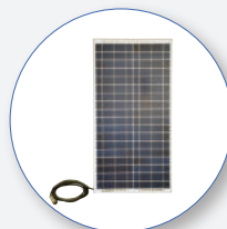
SB371 Solar Panel to Monitoring Station