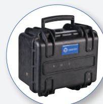
SB275 External 33 Ah Battery to Monitoring Station