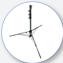
SA206 Mast for Microphone Protection Kit